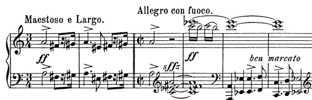
Example 1: Prospero's motive 9

More than forty passages in Bouře have been identified as significant by various authors. Most of them belong to groups of characteristic musical material representing characters, and subsidiary material that represents continuing action. Each group has its own characteristic style, and its own method of development or transformation. I have identified four thematic groups that are clearly related to principal characters, and are strongly related to the sonata allegro form. They are shown here in the order that they appear in the exposition.