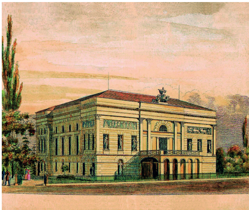
Fig. 3 The building of the National Theatre in Pest, opened in 1837. During the decades to come, Ferenc Erkel was the chief conductor of the theatre's operatic department.