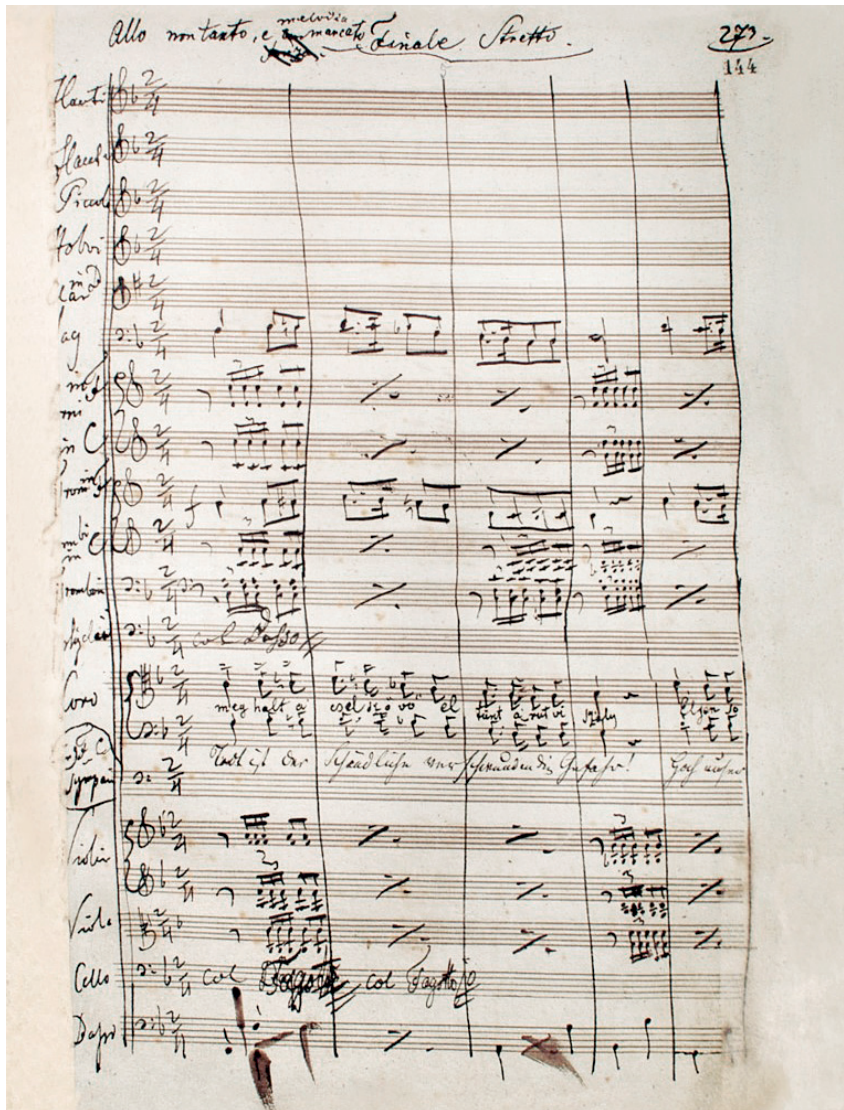
Fig. 5 Ferenc Erkel: Hunyadi László . The Finale of the first act in the autograph score of the opera, which became a national topos. In the vocal part, an early German translation can also be seen, below the original Hungarian text. The chorus “Meghalt a cselszövő, eltűnt a rút viszály” [The traitor is dead at last, and no discord any more] spread nationwide in various arrangements, especially during the 1848 Revolution and War of Independence.