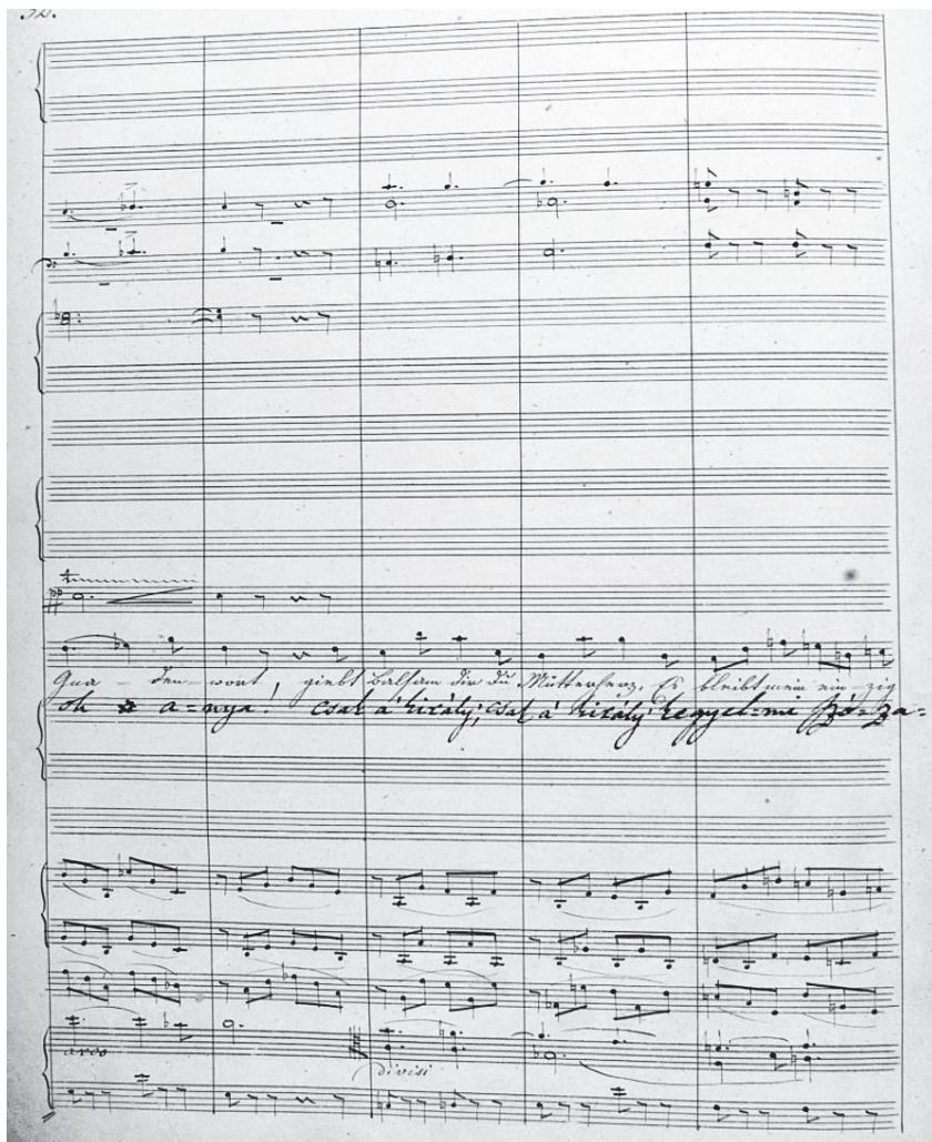
Fig. 6 Ferenc Erkel: László Hunyadi (1844). Score copy of the National Theatre, made shortly after the premiere of the opera, probably before 1847. Originally, it only contained the text in German, but later the theatre had the Hungarian text introduced in it, as well. Music and Theatre History Collections of the National Széchényi Library