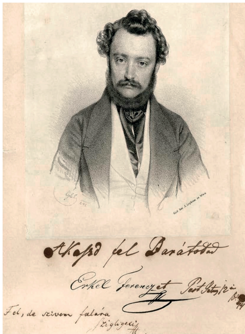
Fig. 2 Ferenc Erkel in 1841. Lithograph with Erkel's dedication addressed to Ede Szigligeti from 1844, the year when the two wrote a folk play ( Volksschauspiel ) together. Music and Theatre History Collections of the National Széchényi Library